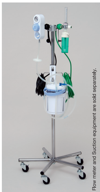
Oxygen and Suction Stand